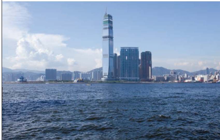
The West Kowloon Cultural District At the forefront of a global trend

Hong Kong will be at the forefront of a global trend. Major cultural centres have gone beyond grouping individual facilities and have developed successful cultural districts.