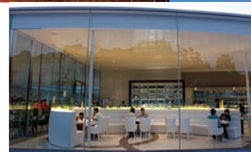
21st Century Museum of Contemporary Art, Japan Stylish Coffee Shop