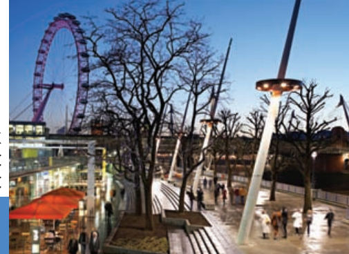
London's South Bank Waterfront Landmark Entertainment