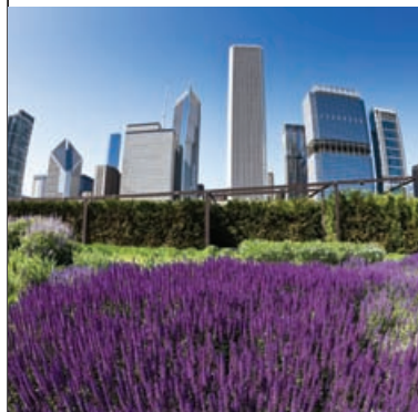
Chicago's Millennium Park Living Green in the City