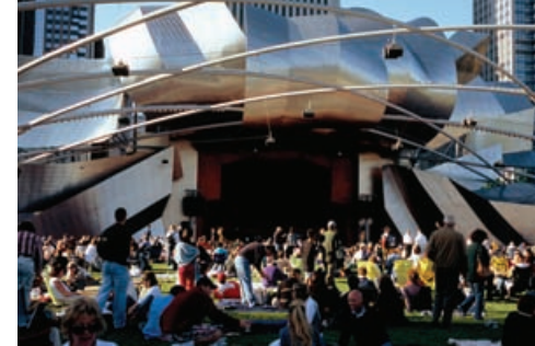
Chicago's Millennium Park Outdoor Performance Venues