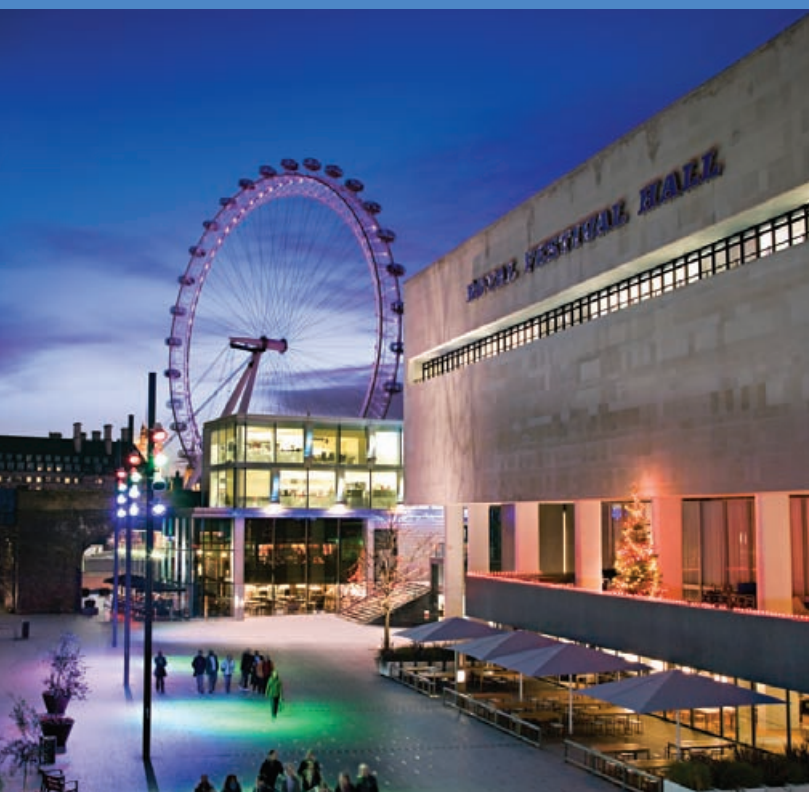
The South Bank, London A Vibrant Waterfront

A cultural district consists of a vibrant mix of world class arts and cultural venues, excellent programmes, great open spaces, unique shops and restaurants and entertainment facilities – a place where people can enjoy themselves, as well as learn, live and work.