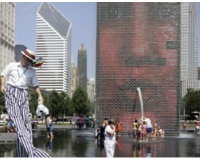
Crown Fountain, Chicago Millennium Park An Active Public Square