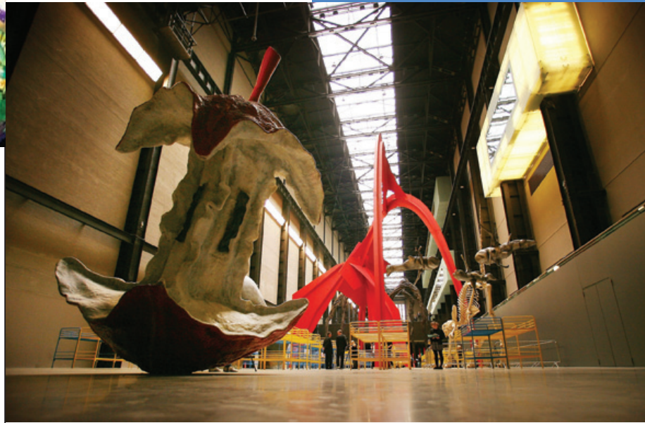
The Tate Modern's Entrance Hall, The South Bank, London Giant Exhibition Space for One-of-a-kind Sculptures or Installations