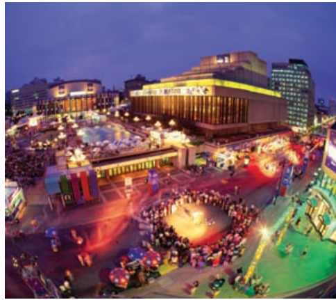
Quartier des Spectacles, Montreal A Colourful Destination