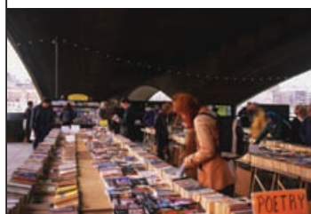
The South Bank, London Cultural Shopping