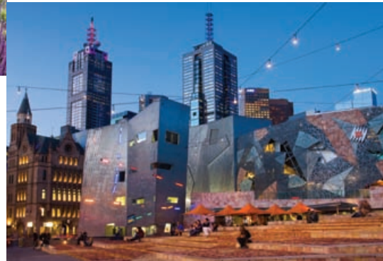
Cultural Precinct and Federation Square, Melbourne A New Cultural Spine