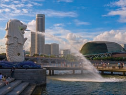
Esplanade and Empress Place, Singapore A Cutting Edge Cluster