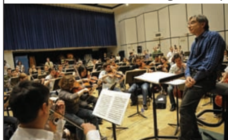
Julliard School, Lincoln Center, New York The Music Learning Facility