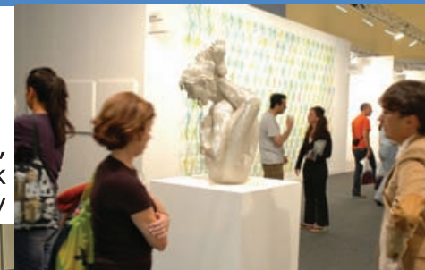
Basel Art Centre, Switzerland A successful Exhibition Centre for Arts and Culture