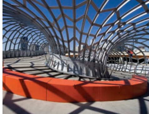
Melbourne's Docklands Bridge Showing Public Art