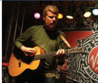
Flagship Music Stores Live Entertainment