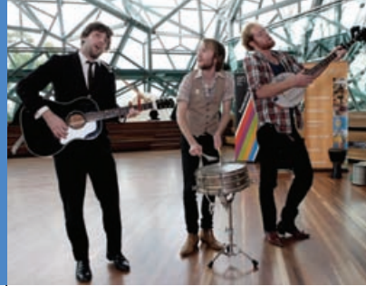
Performances and Exhibitions in Melbourne Flexibility and Sharing of Space